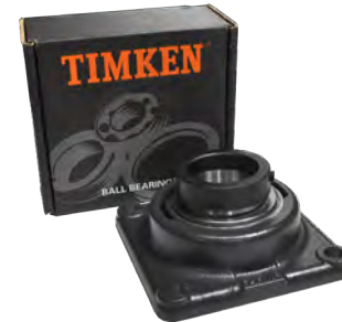
Insert Bearing with Collar