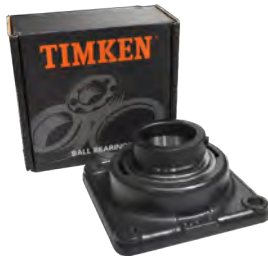
Bearing with Collar